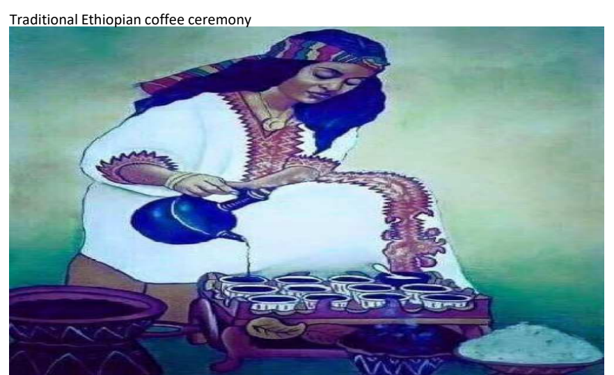
Did you know that Coffee is originally from Ethiopia region of Kaffa?